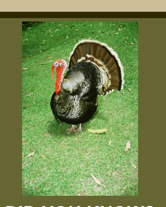
DID YOU KNOW?

Did you know that we have 2 different turkeys in Florida?