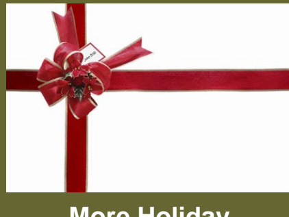
More Holiday Shopping!

Largo Central Park will have more than one million spectacular lights that will surely brighten your holiday season. The park illumination is on Saturday from 6:00 PM until 9:00 PM.