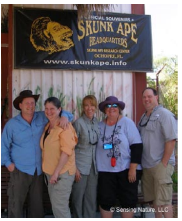
Side trip to the Skunk Ape Research Facility Headquarters.

A giant flock of white pelicans resting on a mangrove island spit was also one of our trip highlights; they seemed to be enjoying their south Florida vacation. Approximately 500 white pelicans nestled along the shoreline qualifies as a giant flock, right?