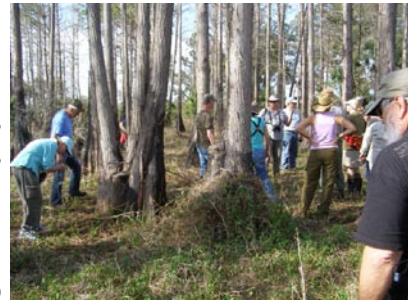
Class walking through a dry cypress dome, a semi-permanent wetland.

We had beautiful weather and it was a great way to spend February and early March. Also, we would like to thank Bill Jackson's sporting goods store for hosting the class. I don't think any of us made it through the course without salivating over their wonderful stocked shelves full of field gear.