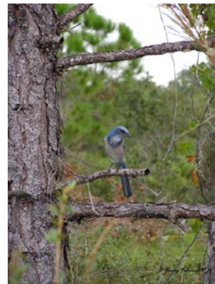
Threatened endemic, the Florida scrub jay

Learn about the concepts, language, and science related to conservation needs, planning, and action. Better understand the complexities of conservation making yourself a better educator and participant in local conservation efforts.